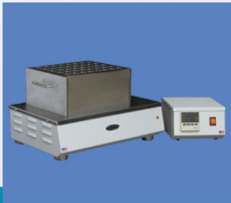
Model BD-40 / BD-16