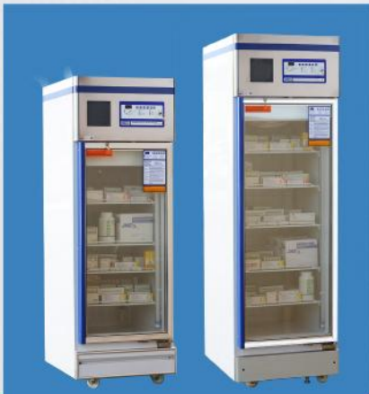
Model PHARMA-250 / PHARMA-500