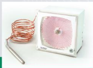
Optional 7-day chart recorder