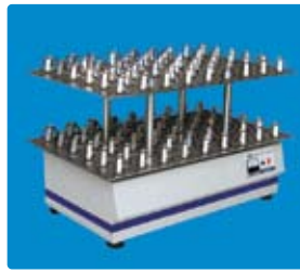
Model 722-2T (10 to 250rpm)