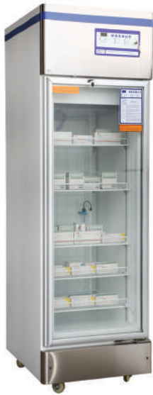
Model MF-250 / MF-500